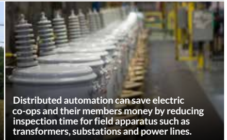
Distributed automation can save electric co-ops and their members money by reducing inspection time for field apparatus such as transformers, substations and power lines.

DA not only has a hand in preventing outages, but this suite of technologies can save electric co-ops and their members money by reducing inspection time for field apparatuses such as transformers, substations and power lines.