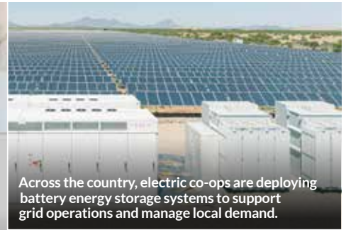
Across the country, electric co-ops are deploying battery energy storage systems to support grid operations and manage local demand.