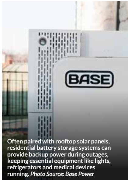
Often paired with rooftop solar panels, residential battery storage systems can provide backup power during outages, keeping essential equipment like lights, refrigerators and medical devices running.

Across the country, electric co-ops are deploying battery energy storage systems to support grid operations and manage local demand. Batteries can store excess electricity from renewable sources like solar and wind, then