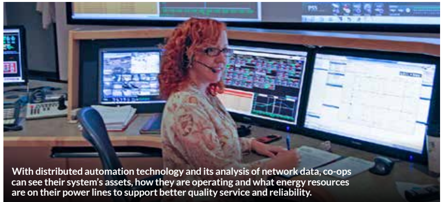
With distributed automation technology and its analysis of network data, co-ops can see their system's assets, how they are operating and what energy resources are on their power lines to support better quality service and reliability.

When power lines are damaged or shortened by storms, critters or some disaster, DA systems can reroute electricity from the power source to unaffected infrastructure. This allows electric service to continue uninterrupted to a community that would otherwise suffer an outage.