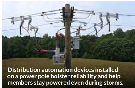
Distribution automation devices installed on a power pole bolster reliability and help members stay powered even during storms.