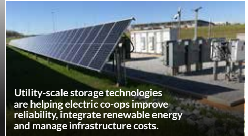
Utility-scale storage technologies are helping electric co-ops improve reliability, integrate renewable energy and manage infrastructure costs.

discharge it when demand rises, which can help balance supply and demand and improve grid stability. They also provide an alternative to traditional infrastructure upgrades. In areas where energy use is growing, a strategically placed battery can handle short-term peaks in demand, reducing the need for new substations or extended power lines. This can lower capital costs and reduce construction timelines.